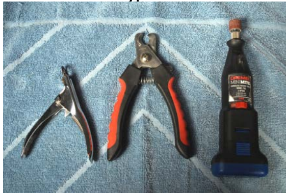
Guillotine Clipper, Dual Cutting Blade Clipper, Dremel

A Word on the Dremel – Use a coarse sandpaper attachment. Use only a cordless dremel, a corded one is too fast. Start at low to get dog used to the noise. On “high”, brush bottom of nail until right length (see above). Be careful if dog has furry feet (so fur doesn't get caught).